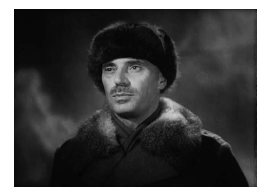
2. Gen. Władysław Anders playing himself in Wielka droga – a frame from the film