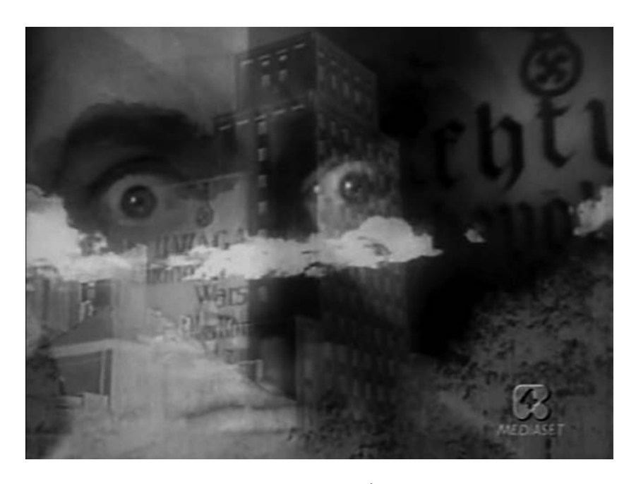
3. An SS man whose memories of events from Warsaw (perhaps a reference to the Warsaw Uprising?) are coming back, a frame from the film Lo Sconosciuto di San Marino copyright unknown